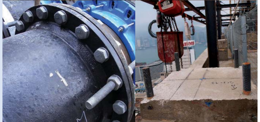
I Square No.63 Nathan Road, Tsui Sha Tsui 尖沙咀彌敦道63國際廣場